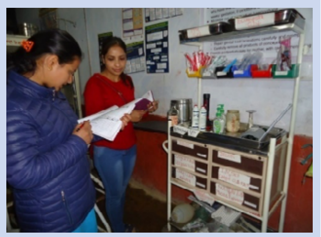
Maternal and newborn health readiness quality improvement self-assessment by health workers at Baitadi District Hospital, Nepal.

The UK has been a long-term supporter of Nepal's health sector programme that is focused on building a resilient national health system to achieve UHC. UK efforts have focused on working with the government to strengthen many aspects of their health system including health governance, financing, and public financial management; data use for decision making including through digital technologies; quality of care; procurement of medical supplies; design of more climate resilient health infrastructure; and strengthening gender equality and social inclusion. This has contributed to a reduction in maternal mortality (from 539 maternal deaths per 100,000 live births in 1996 to 239 in 2016) and child mortality (from 50 neonatal deaths per 1,000 live births in 1996 to 21 in 2016).