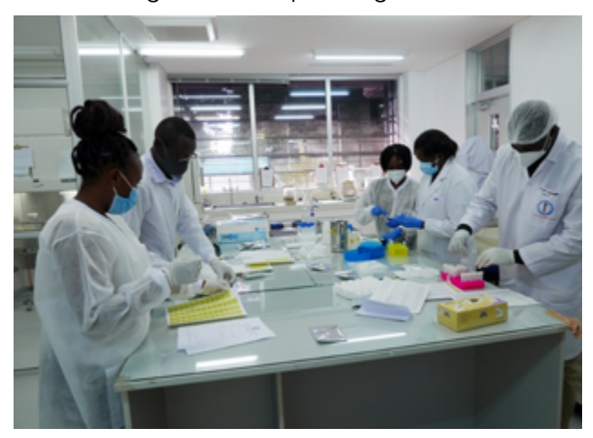
Scientists at work in the Kenya Medical Research Institute (KEMRI) laboratory, Nairobi, Kenya.

national health systems to be able to prevent, detect and respond to disease outbreaks and comply with the IHR. This also includes building regional institutional capacity such as the African Union Centre for Disease Control and Prevention, working with DHSC-funded UKHSA colleagues through the IHR Strengthening project to build technical capabilities. Our health security programmes are tailored based on country needs and we will work with country counterparts on particular health system bottlenecks, such as surveillance systems, laboratory systems, monitoring and building health workforce capabilities. This includes strengthening public health institutions, using the latest scientific evidence, and sharing learning such as on genomic sequencing.